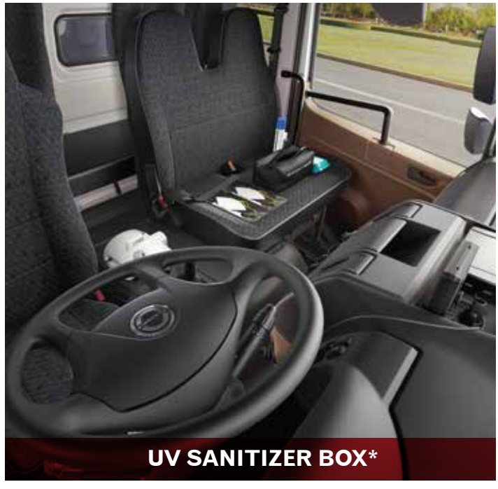
Note: * Accessories only and not part of Standard fitment.